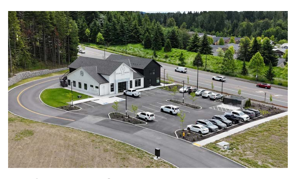
PARCEL A Lot 7: Ossman Harding Dental