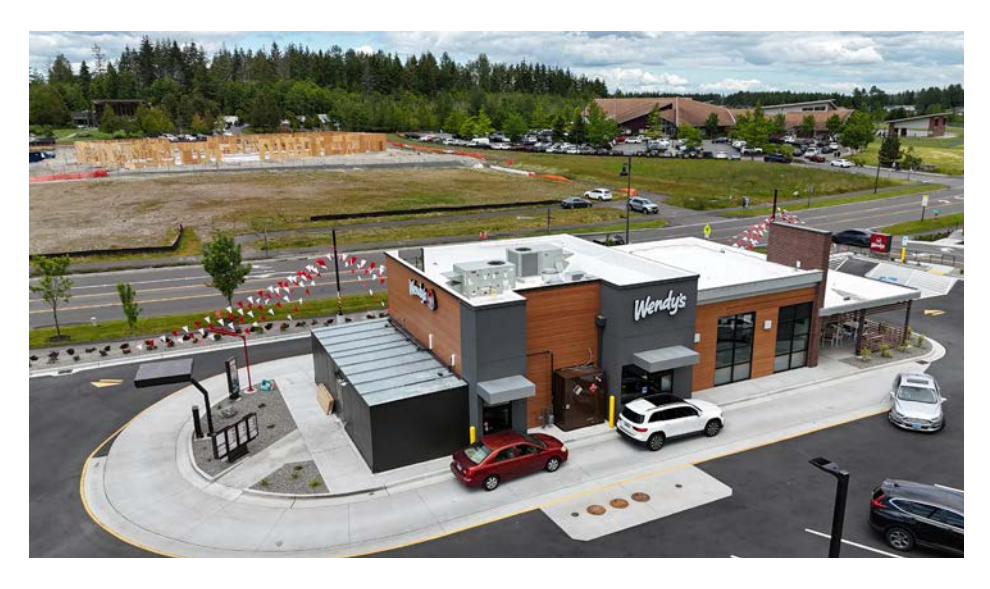
PARCEL A Lot 2: Wendy's