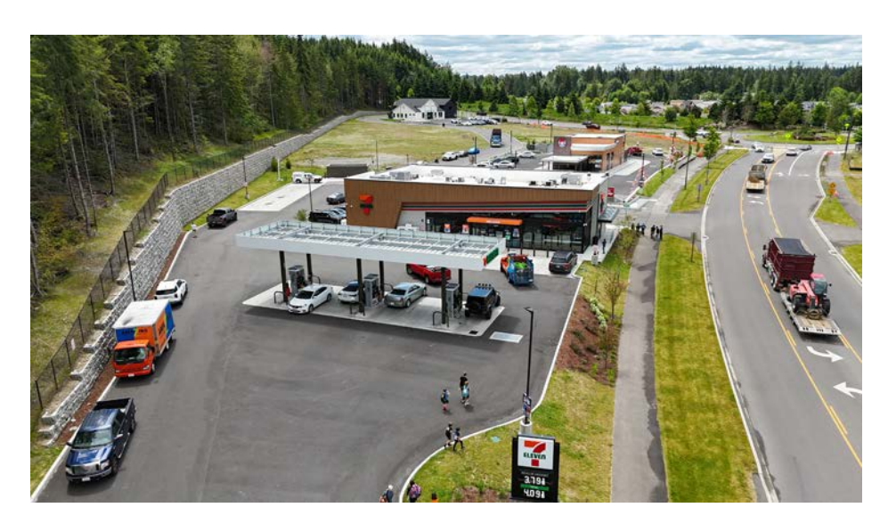
PARCEL A Lot 1: 7-Eleven