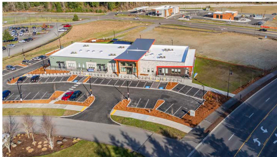
PARCEL B Lot 3: Kiddie Academy