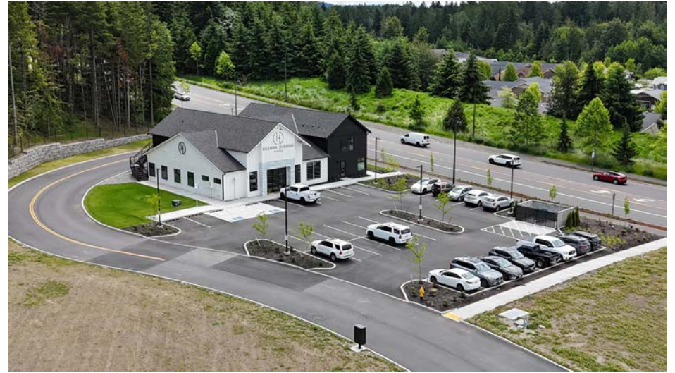
PARCEL A Lot 7: Ossman Harding Dental