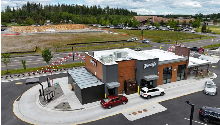
PARCEL A Lot 2: Wendy's