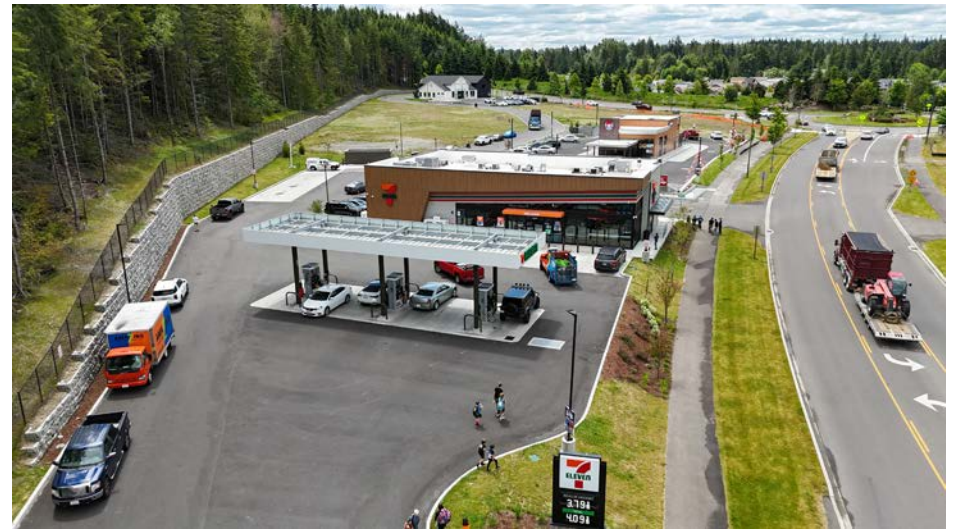
PARCEL A Lot 1: 7-Eleven